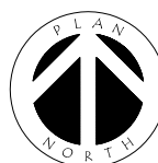
FIRST FLOOR PLAN 3/32" = 1'-0" 4,157 S.F.

September 09, 2009 - 11:08am E:\Projects\2009 Projects\09077 Pinegrove CF\00_Cadd\Prelim\09077 FP-1.dwg